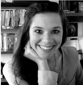
Writer Rachel Peñate