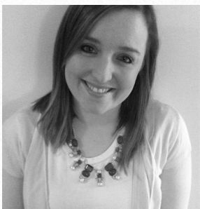
Photography* Cailin Valente